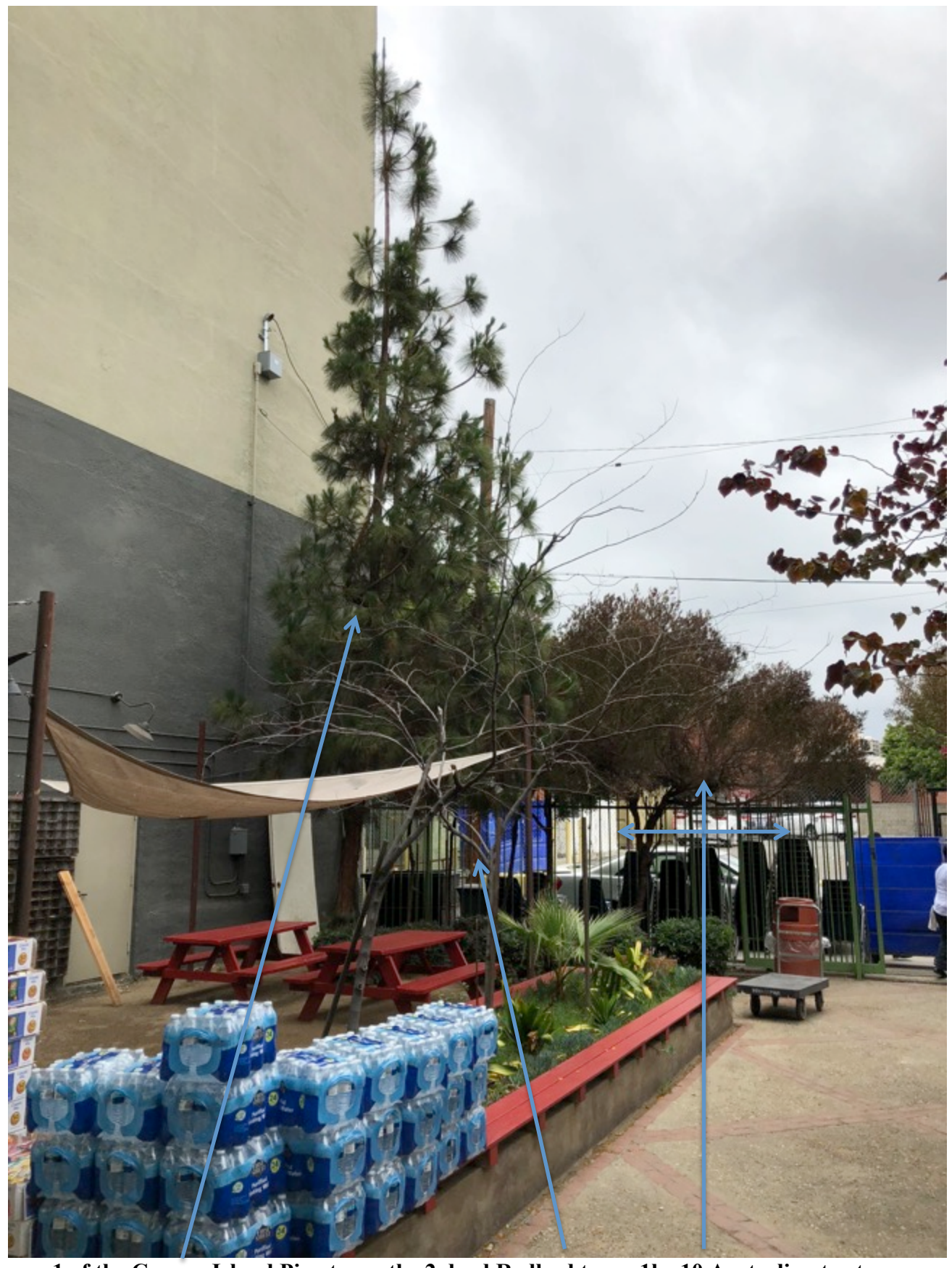
1 of the Canary Island Pine trees, the 2 dead Redbud trees, 1he 10 Australian tea trees